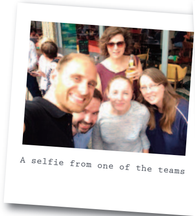
A selfie from one of the teams